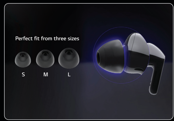
Medical-Grade Ear Gels Hypoallergenic and Comfortable

*UVnano is a compound word derived from the words UV and its unit nanometer. *Independent testing shows the UVnano charging cradle kills 99.9% of E, Coli & S, aureus bacteria on the speaker mesh of the earbuds in ten minutes while charging. The UV LED function works only when the charging cradle is connected to the power cable. *UV LED light is invisible and is only activated when the charging cradle is closed with the earbuds inside. The blue mood light is for aesthetic purposes only and appears when the charging cradle lid is opened.