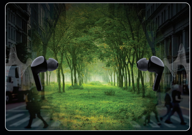
Active Noise Cancellation Specialized ANC to Reduce Urban Noise

*This device or any of its parts is not intended or implied to prevent or treat any health conditions; it is not a medical device, nor for use as or to replace a medical device. The base material in silicone ear gel meets ISO 10993 and USP Class VI requirements.