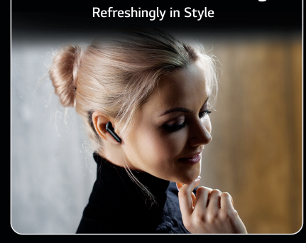
Sleek and Minimal Design