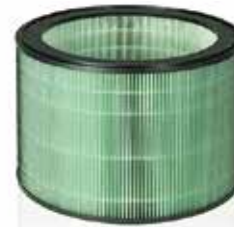
Total Dust Collection & Allergy Care Remove over 99% of Ultra-fine particles**

The LG PuriCare Air Purifier has a filter system that removes harmful substances in six steps.