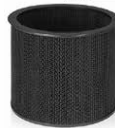
Total Harmful Gas Care Remove Living odor, Smog and Airborne Chemicals